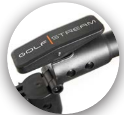
ONE-TOUCH EASY FOLD SYSTEM