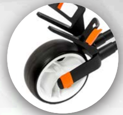
ANTI-CLOG WHEEL HOUSING