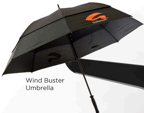
Wind Buster Umbrella