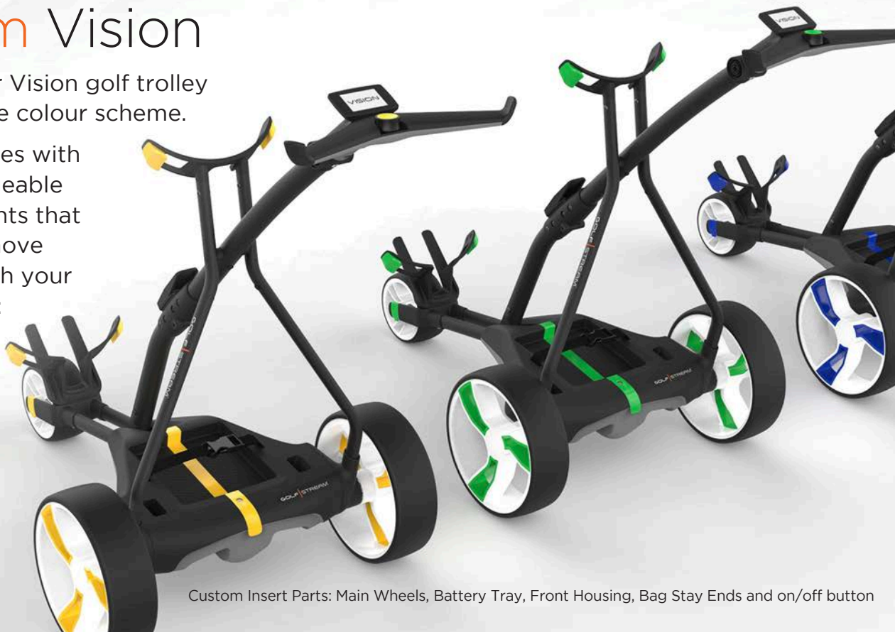
Custom Insert Parts: Main Wheels, Battery Tray, Front Housing, Bag Stay Ends and on/off button