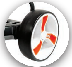
DURABLE HIGH GRIP TYRES